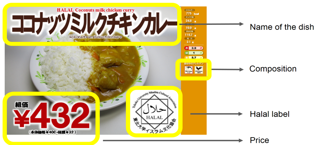
The example of Halal Food menu prepared by COOP

Halal Food already provided in every campus in Tohoku University. This is the list of place which provided halal food :