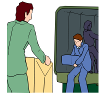
Recipient of Goods

② Recruited recipient receives the goods.